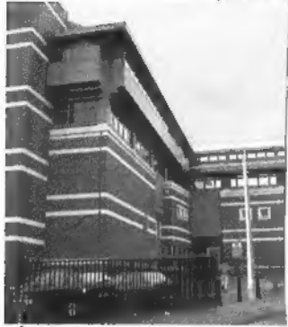
Strangeways prison, Manchester, UK